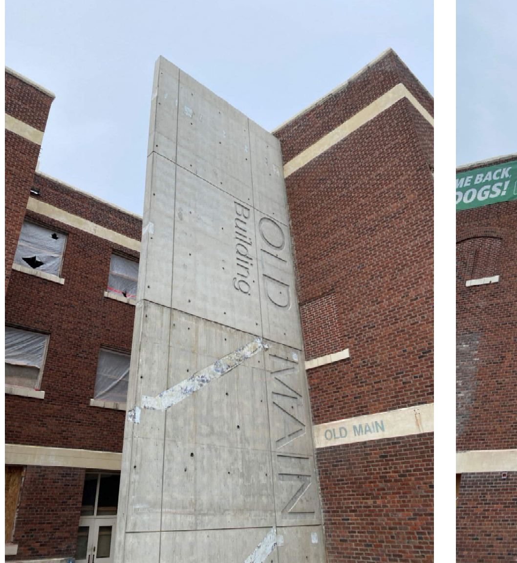
South Stair Tower

MVHS Old Main http://mvhsoldmain.lydig.com/