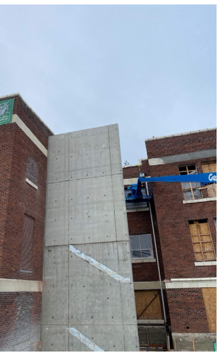
North Stair Tower